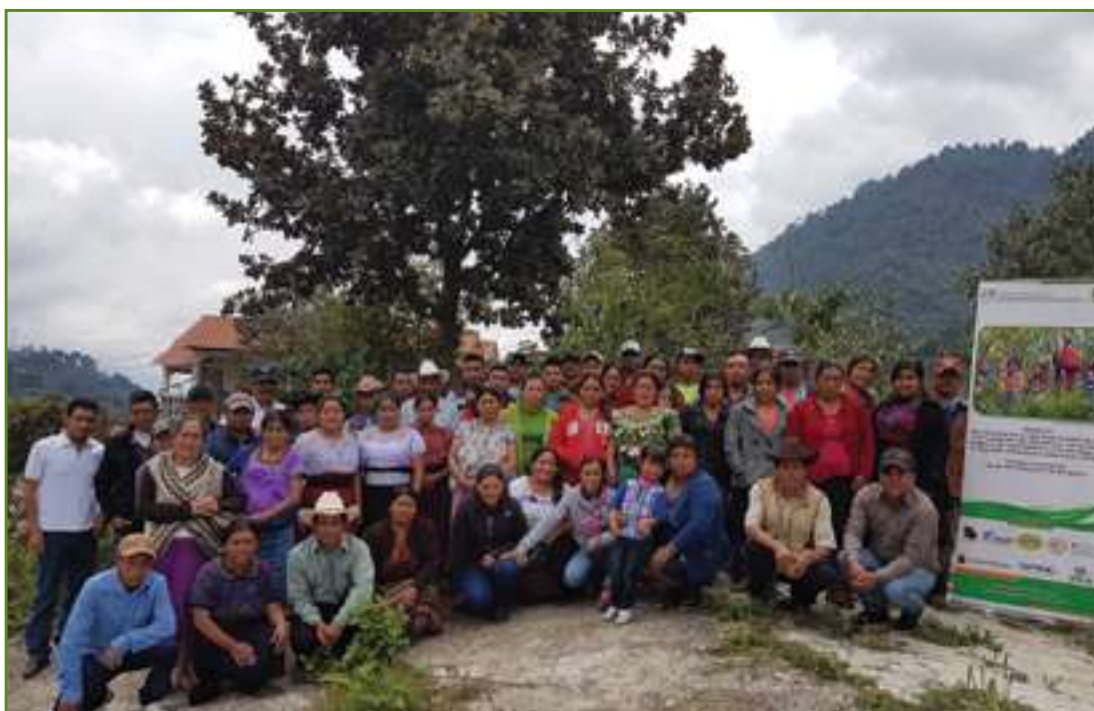
O-ITPGRFA/Benefit Sharing Fund

These are just some examples of the many practical activities currently undertaken in an attempt to promote or realize Farmers' Rights at country level. Learners are encouraged to express their ideas, opinions and thoughts in identifying tools, approaches and strategies to enhance understanding of Farmers' Rights, and to take measures to protect and promote it.