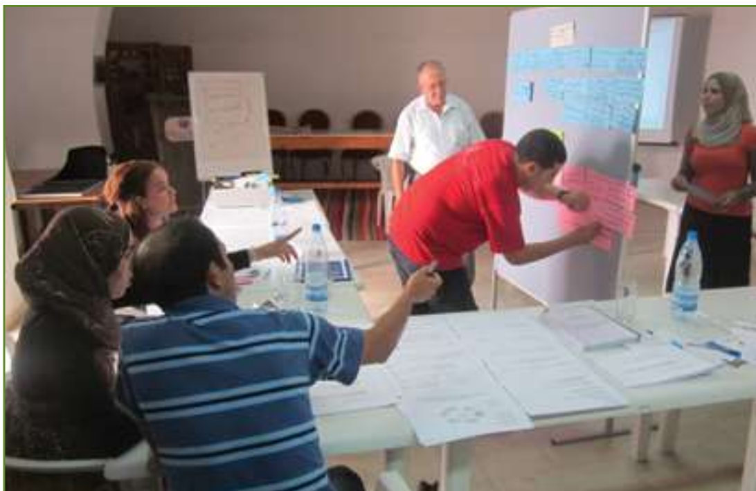
ICARDA/BSF Project Morocco

The involvement of farmers is crucial. Lead farmers representing four major faba bean growing areas were selected in cooperation with the Centre des Travaux, which has been working with farming communities in their respective regions for several years. The selection of lead farmers was made in order to identify the various agro-ecological challenges faced by producers in different areas. Under the guidance of the International Center for Agriculture Research in the Dry Areas (ICARDA), 359 faba bean landraces are conserved in the National Gene Bank of Morocco, and 68 accessions collected during