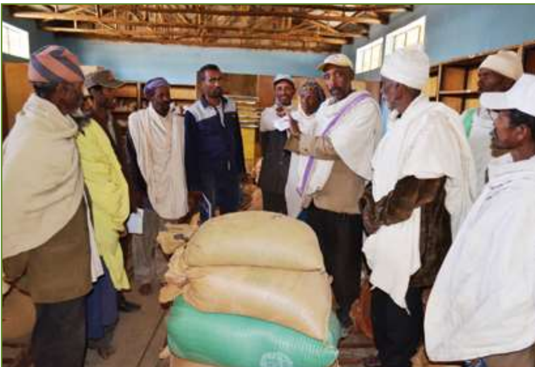
Institute of Biodiversity Conservation, Ethiopia

- Environmental follow up: another central goal of the SoS is the environmental education with focus on sustainable management of biodiversity that is being promoted in the primary schools, including the creation of school arboretums. These can be very relevant and useful teaching tool because they give the pupils practical training in relation to environmental issues. In addition to scientific knowledge, village elders are also invited to share their knowledge and experience with